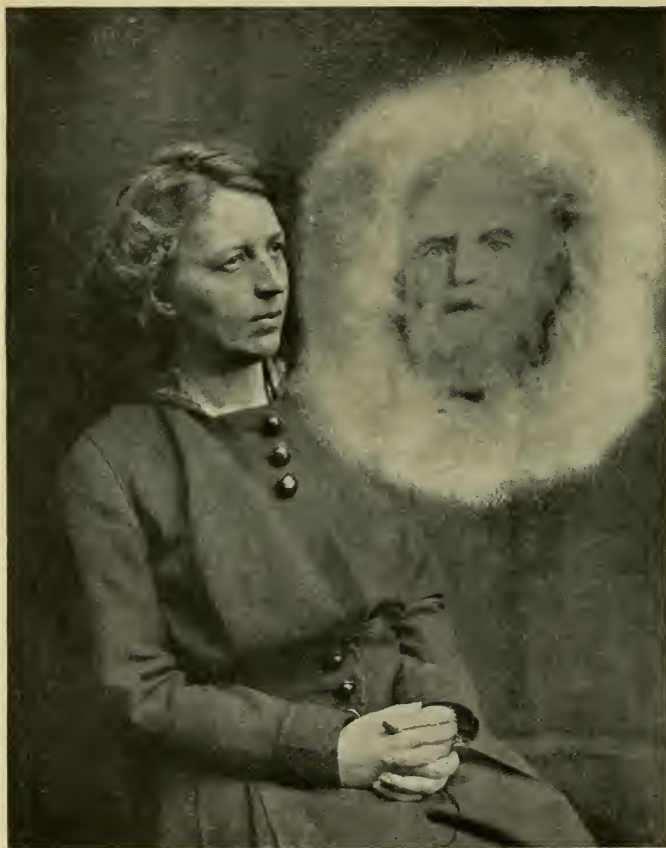
Psychic Photograph of W. T. Stead given at Crewe, 1915. See Introduction.